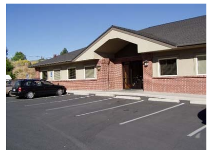
2065 NE Williamson Ct., Suite B, Bend, Oregon 97701